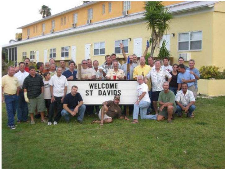
Everglades City Welcomes St. David's Men's Club

God our Father, in your wisdom and love you made all things. Bless those fathers who have taken upon themselves, the responsibility of parenting. Bless those who have lost a spouse to death ... or divorce who are parenting their children alone. Strengthen them by your love that they may be and become the loving, caring persons they are meant to be. Grant this through Christ our Lord. Amen