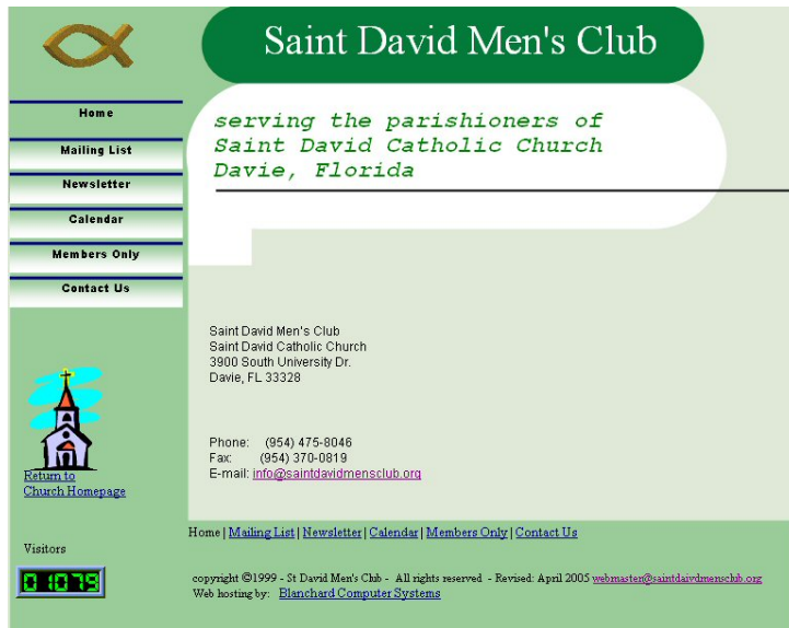
Home page of our new website