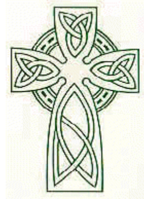
Saint David Men's Club