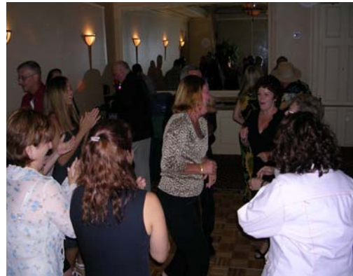
The Ladies demonstrate how to cut a rug