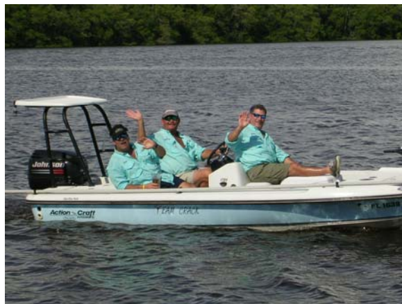
Team Crack showed up in their uniforms. Class act!!

After Prime Rib, baked potato and salad bar on Sat night we had a 50/50/50 raffle with $450.00 ($150/$150/$150). Thanks to Jason Cull's girl friend Loren for taking care of the ticket sales. She says she wants to fish next trip...but not with Jason.