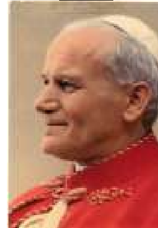
Pope John Paul II (1920-2005)

Eternal rest grant unto him, O Lord, and let perpetual light shine upon him. May his soul and the souls of all the faithful departed rest in peace. Amen.